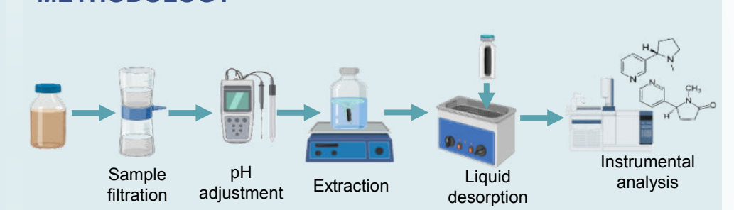
Figure 2: Proposed analytical approach.